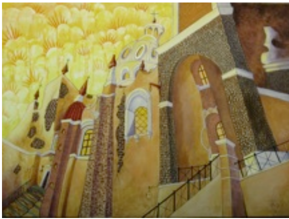
"7th Chakra", oil on canvas, 56" x 40"