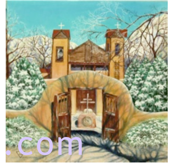
"Shadows and Lace", oil on canvas, 40" x 40"