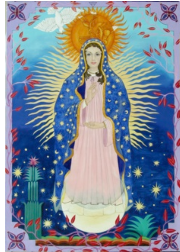
"Our Lady of Guadalupe", oil on canvas, 60" x 42"

www.dvbpaintings.com dzb@dvbpaintings.com