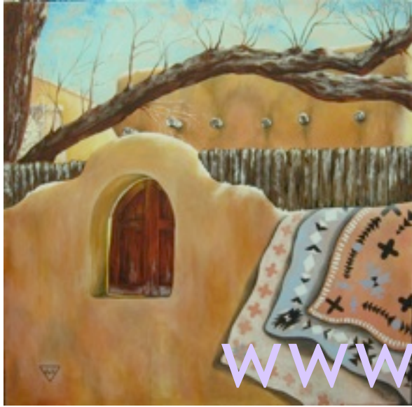
"Guadalupe District Wall", oil on canvas, 42" x 42"