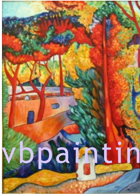
"Adobe Sanctuary", oil on canvas, 55" x 40"